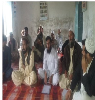
A view of Focal Point Training at MSB-125 Gandaf