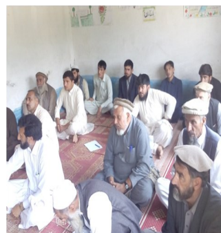
A view of teachers attending Focal Point Training at MSB-257

FPT is a regularly practice in BEFARe school teachers' which continually enhance capacity of teachers. During the month of April, 2016, BEFARe trained a total of (642) teaching staff including (120) female teachers through Focal Point Training in Sub-office Peshawar, Mardan, Abbott bad and Timergara. FESS organized these trainings in various topics e.i, factors of learning, motivation, learner based teaching methods, how to find proficiency score, how to use map in teaching and Mathematics and Bio of grade 8 etc in the presence of Master Trainers and Field Education Officers.