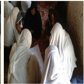
A view of Group activity in female SMC training