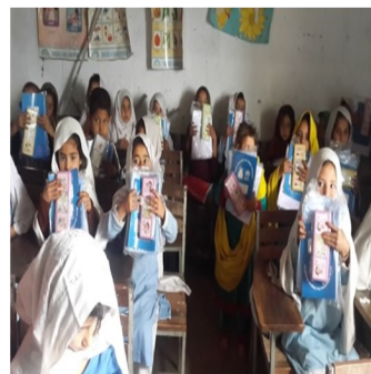
Grade 1 students received uniform and stationery

BEFARe with generous support of UNHCR successfully distributed school uniform to all boys and girls students of grade 1 and stationery (notebooks, pencil box, geometry box, shorpnors, pens, pencils and clip boards) in 28 schools located in winter zone of Timergara and Mansehr in March, 2016 the aforementioned schools were closed in January and February, 2016 on account of winter vacation and reopened on 1 st March.