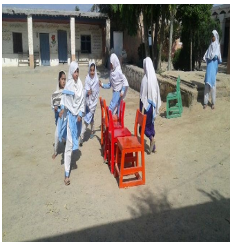
A view of girl participating in Musical chair competition at MSG-349 Akora Camp