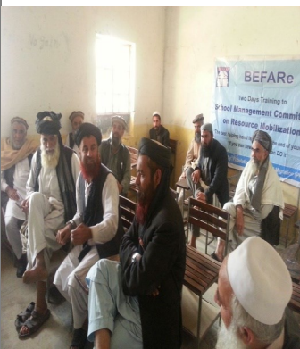
A view of SMC training on Resource Mobilization

CP&D department arranged two days training for capacity building SMCs. Trainings were organized on Resource Mobilization under PRM initiative in sub-office Peshawar and Abbottabad in which total 260 SMC members participated. The trainings were conducted with the objective to mobilize SMC and Afghan communities for provision of space/ classrooms maintenance/ rehabilitation of building and WATSON facilities in the schools by utilize their resources for the best interest of schools.