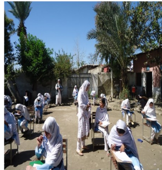
A view of Educational competition at MSG-105 Naguman