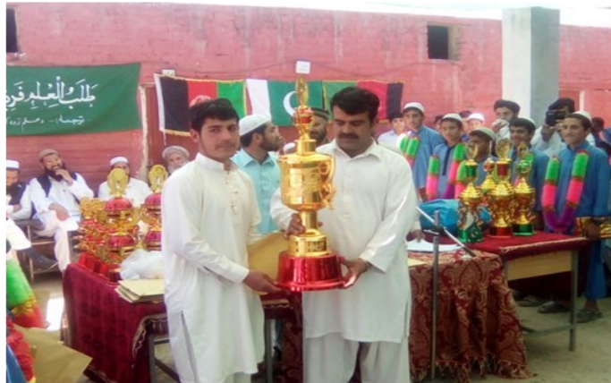
A student receiving trophy after winning educational competition