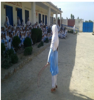
A view of girl doing skipping rope in competition at MSG-349 Akora Camp