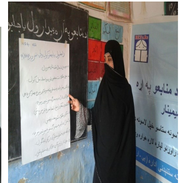
A view of female SMC member explaining the topic