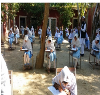
A view of girls competition at MSG - 084 at Haripur

committee. At the end the prizes were distributed among the winner's students.