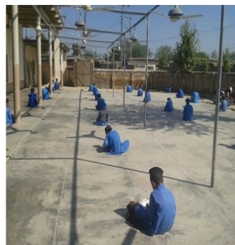
A view of Educational competition in Haripur