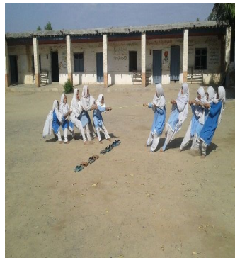
A view of girls participation in sports activities