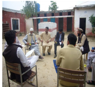
A view of Kick off meeting in BEFARe school, Under AAR

AAR-Japan, BEFARe staff arranged Kick Off meetings at selected BEFARe Afghan schools of Pania 1, Pania 2 and Padana area. The agenda of these meetings were to give orientation on the project activities to the Afghan school staff. Participant of the meetings were briefed on 4 days TOT that will be arrange for the school staff in the summer vacations. It was found that Teachers and SMCs members were conversant with sanitation campaign and kids contests which augur well for the project future activities.